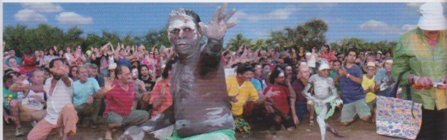
Therese Ritchie, Simon says , 2011, 12 colour inkjet print on Hahnemühle Photo Rag, 308gsm, 100% cotton, 39.5 x 137.5cm (image), 51 x 147cm (paper); image courtesy the artist