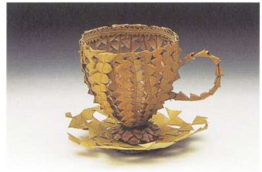
Image: Jo Crawford, Mum's Best Cups 1993 Dried banksia leaves 12cm (H)

Image opposite: Jo Crawford, Mum's Best Cups 1994, poppy petals 12cm (H)