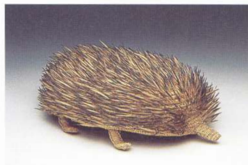
Image: Yvonne Koolmatrie Echidna 1993 rushes (Cyperus gymnocaulos) Echidna quills 45 cms (L)

Image opposite: Yvonne Koolmatrie, Bi-plane 1994, rushes (Cyperus gymnocaulos) 1 metre (L)