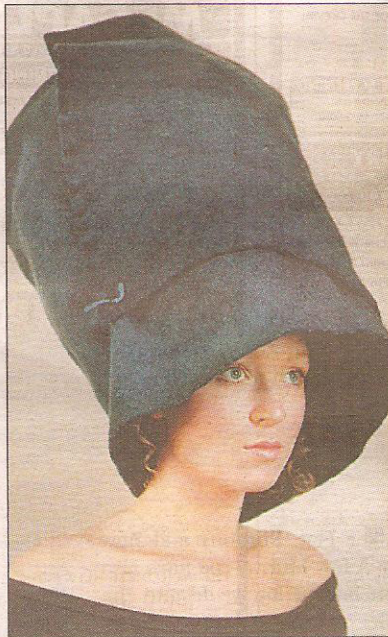
Envelope, 2005, by Sophie Morris: Felt as wearable art.